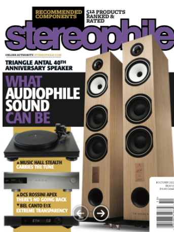
Magazine Stereophile USA - October 2022