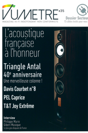
VuMètre Magazine France - June 2021