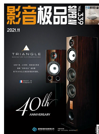
Magazine SuperAV USA - November 2021

« At first, the Triangle Antal 40s' presentation destabilized me. Then a moment came when I got them. How much of that was due to break-in or the habituation process, I still can't say. What I can say is that after a few days of listening, my mind has completely bought into the illusion they weave. [...] The Triangles reveal so much of a note—its tone, pathway, variations, and aftereffects—as to make one note sound like several. Assuming the rest of your system is up to snuff, the Antal 40s will let you hear an inordinate amount of what's on the record. I found it hard to imagine, as I listened, that I was missing anything. I love it when that happens. »