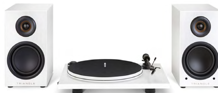
LN01A + TURNTABLE