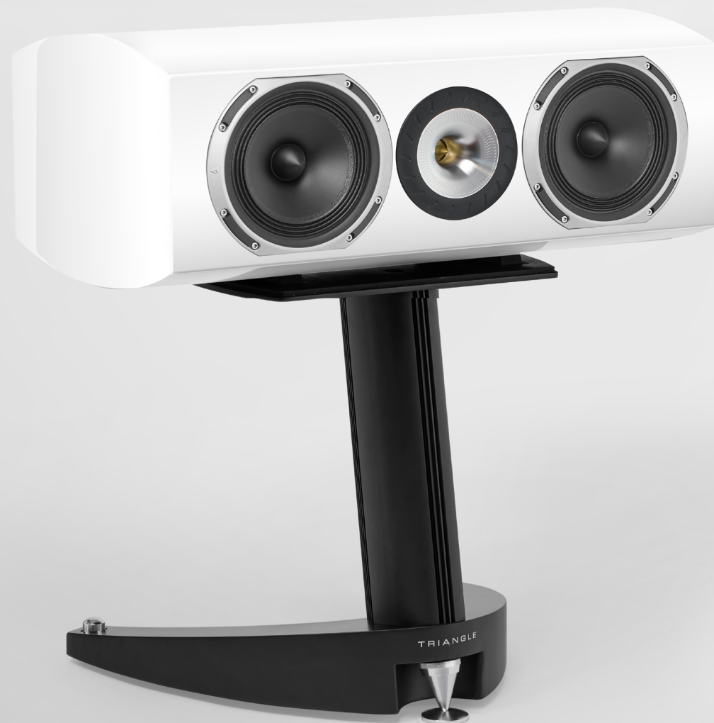
MAGELLAN Voce 40 TH Datasheet